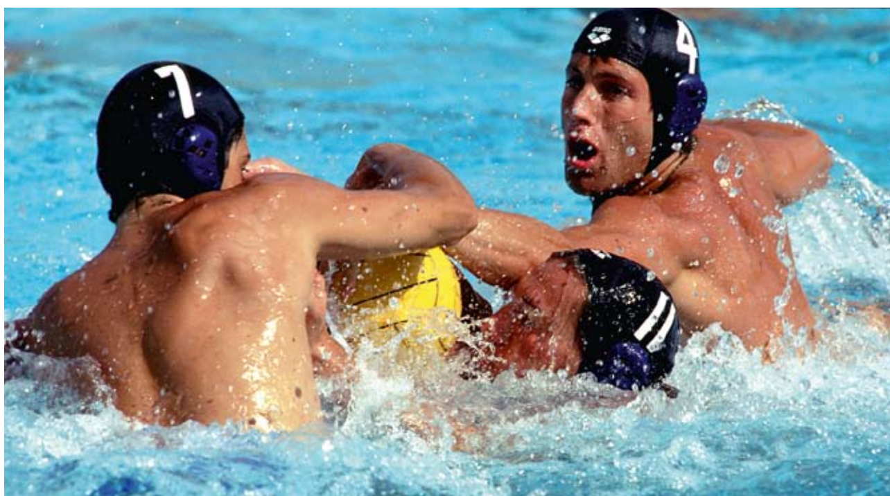
Three players from the same team tussle for the ball in the 2008 European Men's Championships in Malaga.