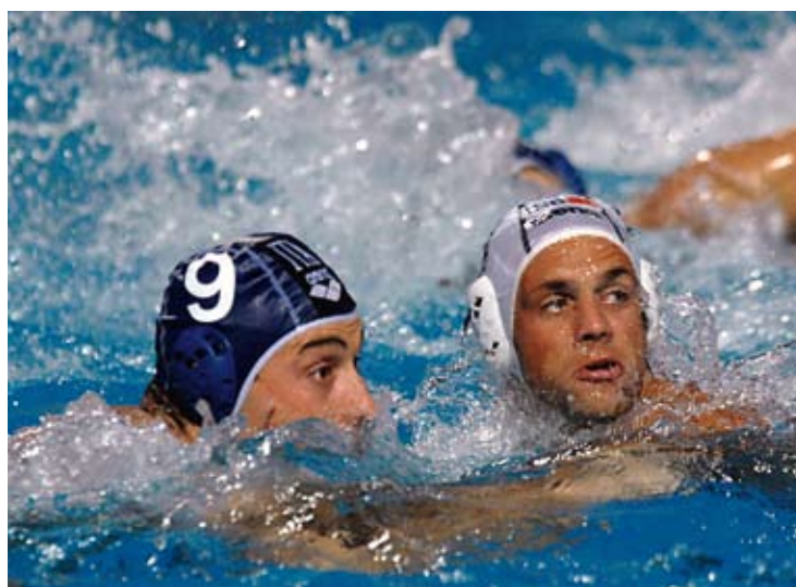
Tamas Kasas (Hungary) in European Championship action. Kasas won an Olympic gold medal in 2000, 2004 and 2008