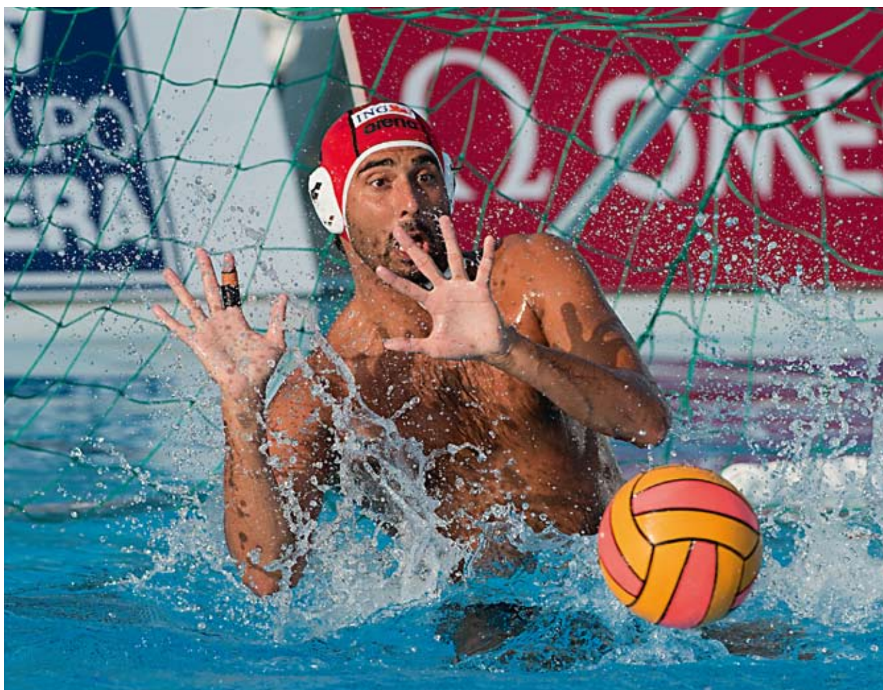
The last line of defence as Hungary and Croatia do battle during the 2008 European Men's Championships in Malaga.