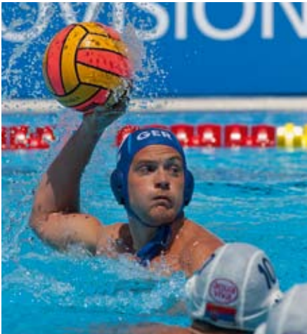
Day 1 of the 2008 European Men's Championships in Malaga and Germany take on Serbia