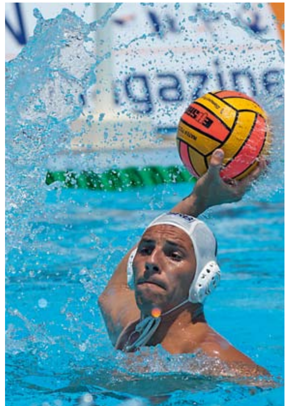
Serbia defeats Germany 17-5 on the opening day of the 2008 European Men's Championships in Malaga.