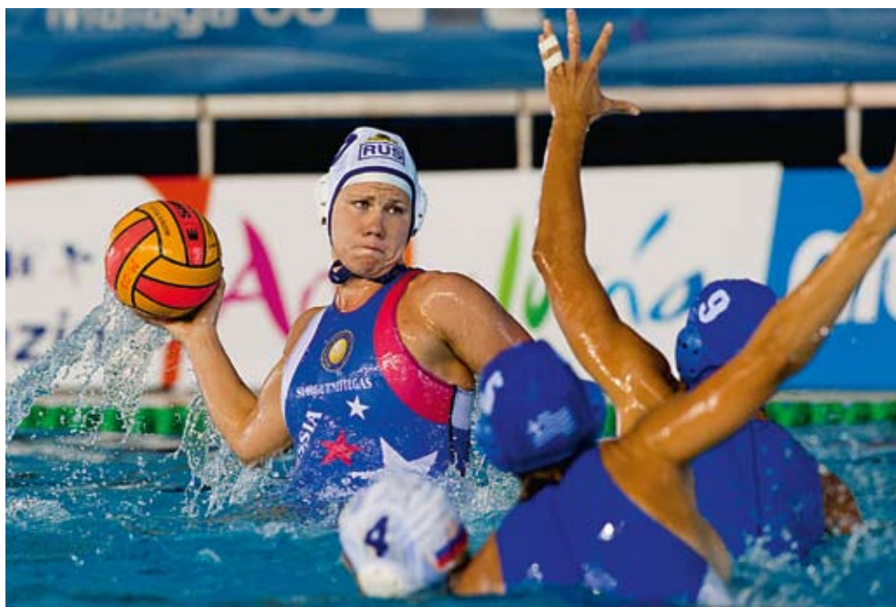
Russia v Greece on day 5 of the 2008 European Women's Championships in Malaga. Russia won 9-7