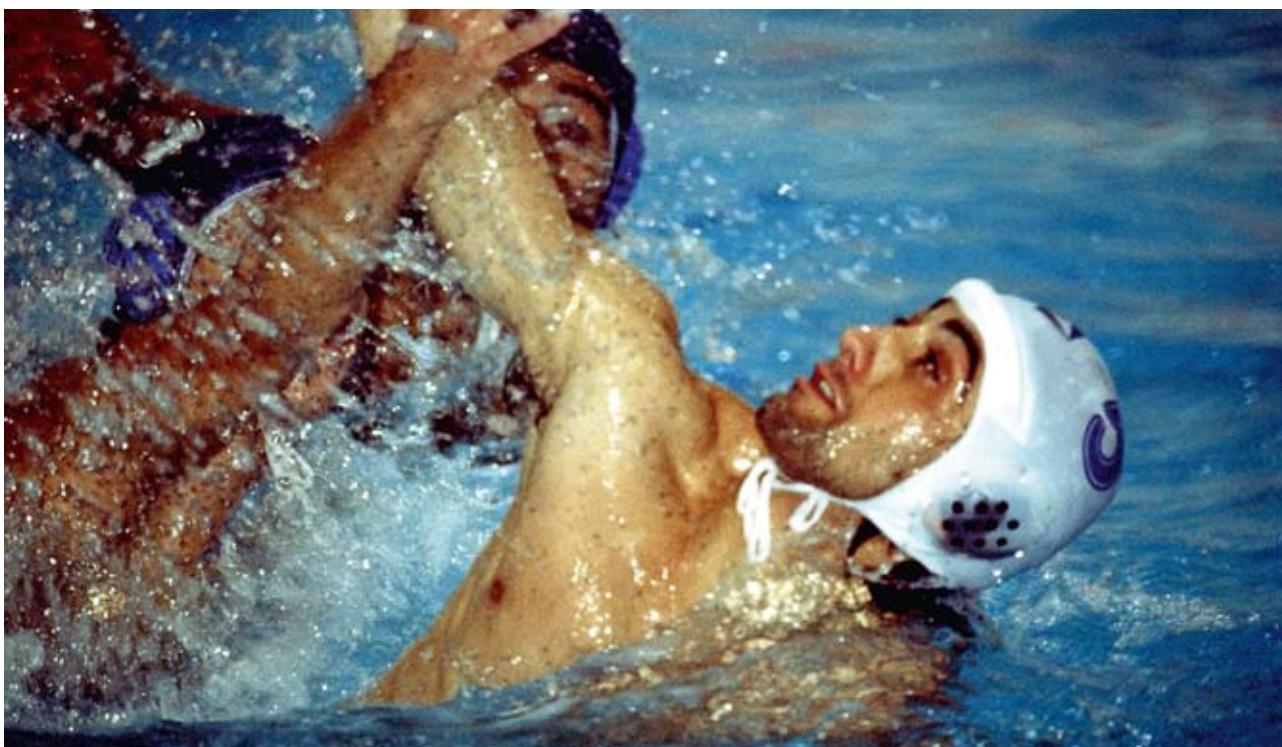
Manuel Estiarte (Spain), one of the greatest players ever, won a European Championship silver in 1991 and a bronze medal in 1983 and 1993. He also won a gold medal at the 1996 Olympics and at the 1998 World Championships and played in 6 Olympic Games

Denis Sefik, Petar Trbojevic, Zivko Gocic, Vanja Udovicic, Dejan Savic, Danilo Ikodinovic, Slobodan Nikic, Filip Filipovic, Aleksandar Ciric, Aleksandar Sapic, Vladimir Vujasinovic, Branko Pekovic, Slobodan Soro, Dusko Pijetlovic, Andrija Prlainovic