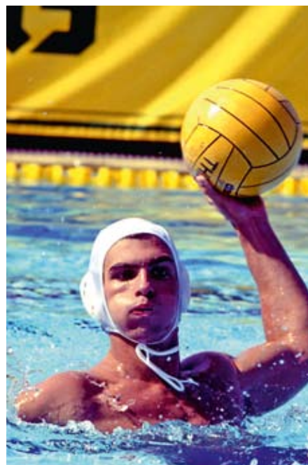
Amedeo Pomilio (Italy), who won gold medals at the European Men's Championships in 1993 in Sheffield and in 1995 in Vienna and the 1992 Olympic Games in Barcelona