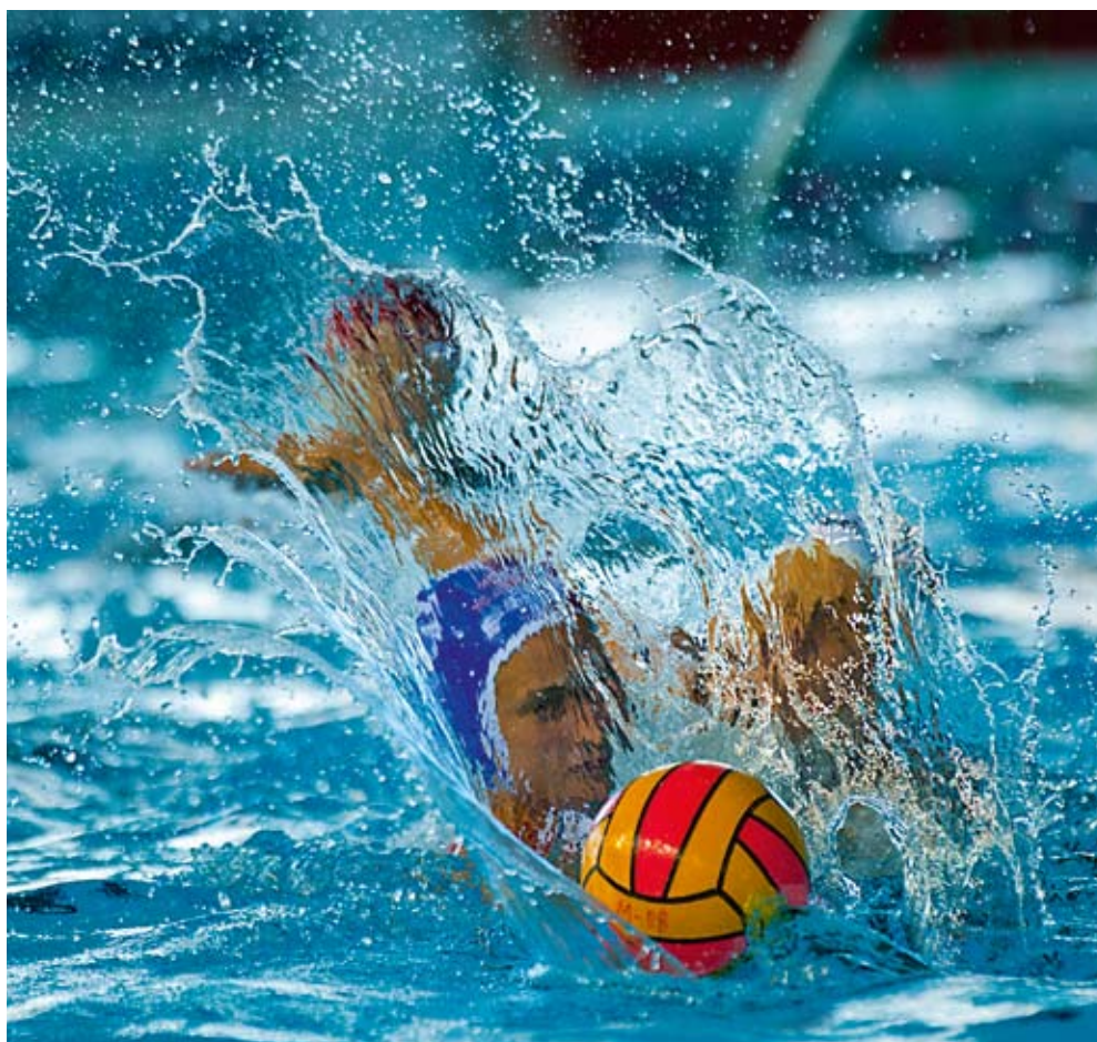
Hungary versus France in the 2008 European Women's Championships in Malaga