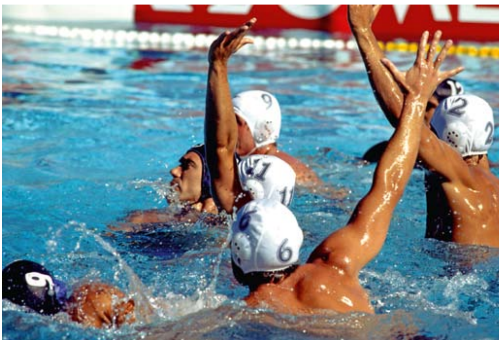
Defensive arms block the way during the 2008 European Men's Championships in Malaga