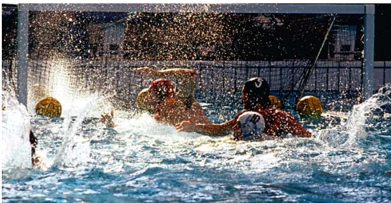
A goalmouth scramble during the 2008 European Men's Championships in Malaga