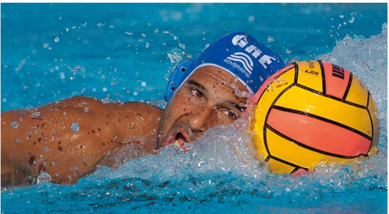
The ball is dribbled out of defence by Greece against Slovakia in the 2008 European Men's Championships in Malaga.